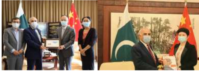
Vice Chancellor KIU receiving Shilelds from Ambassador PR China in Pakistan