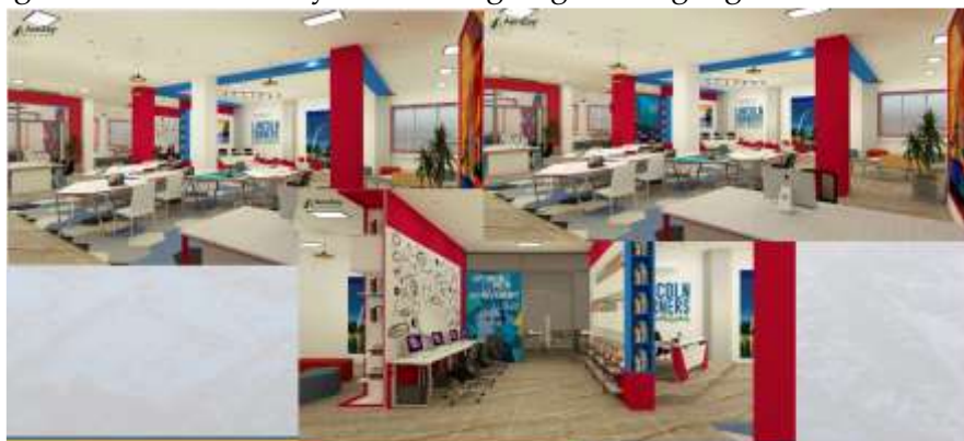
KIU Lincoln Corner at Main Campus