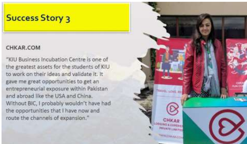
Some of the success Stories of Business Incubation Centre